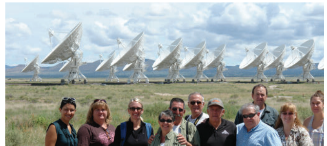
Lifetime Members take a tour of the Very Large Array.

$2,500 – Lifetime Membership (invoice will be sent based on the payment option selected below)