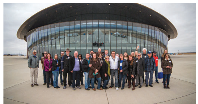
Alumni members toured Virgin Galactic/Spaceport America, which is not yet open to the public.

As a graduate of Leadership New Mexico, you have the ability to be a powerful voice for change. Join us!