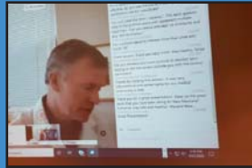
“COVID-19 in a New Mexico Laboratory: Leading with a Scientific Focus”