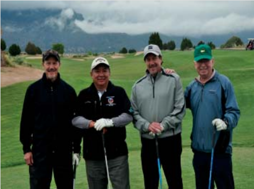
Healy Foundation Team

Join us for our Rescheduled Golf Tournament