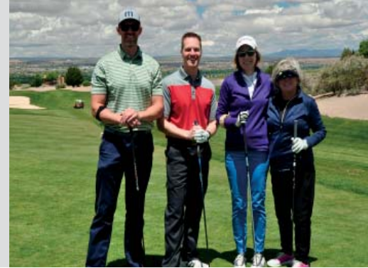
Bank of Albuquerque Team