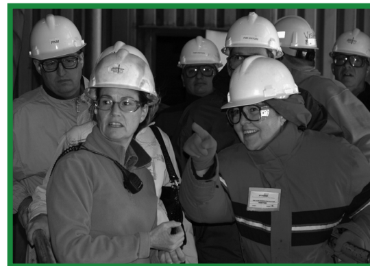
Class of 2008 tours the PNM San Juan Generating Station

Leadership New Mexico is a 501 (c)(3) non-profit organization. Your gift will have a direct impact on the vitality of the organization, its programs and the graduates' influence on the future of the state.