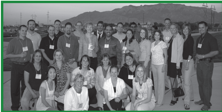
The 2007 Connect New Mexico Class

Connect New Mexico is a program for professionals ages 25-40. The curriculum has elements of the Core Program and the Local Government Leadership Program and focuses on leadership skill development. Connect New Mexico is designed to develop personal leadership skills, teach how New Mexico systems and structures work and explore the critical issues facing our state. This process encourages participants to cultivate new ideas and techniques and helps to develop solutions to some of New Mexico's most pressing issues.