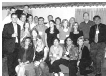
Connect Class of 2010