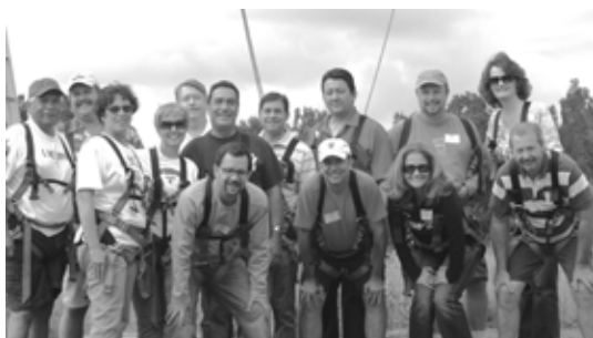
Core Class of 2010