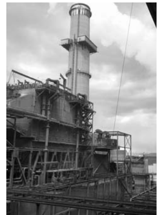
PNM San Juan Generating Station