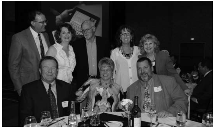
Friends gather at the Bayless Drilling Company sponsored table