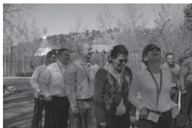
Team building exercises have the group in stitches.