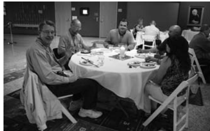
Classmates from the 2011 graduating class, enjoyed dinner and a tour of the National Museum of Nuclear Science and History in Albuquerque.

The application deadline is December 1, 2011.