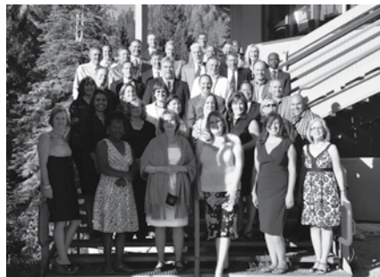
Core Class of 2011

We are pleased to announce the 39 statewide leaders who graduated from the Core Program at the session in Taos in June. The session kicked-off with a rafting trip and ended with the graduation ceremony at the Taos Ski Valley. Highlights included visits to the Harwood and Millicent Rogers Museums, as well as staying at the luxurious El Monte Sagrado Living Resort and Spa.