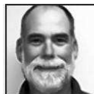
Division Manager, Brycon Construction Rio Rancho