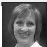
Executive Director, Artesia Chamber of Commerce Artesia