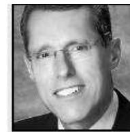
Vice President, Chief Sales and Marketing, Presbyterian Health Plan Albuquerque