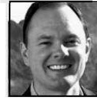
Dean, University of New Mexico School of Law Albuquerque