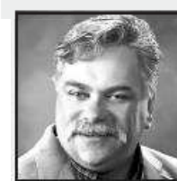
Vice President, Davtek Clovis