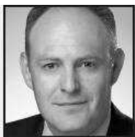
Attorney, Montgomery & Andrews, P.A. Santa Fe