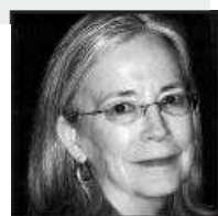
Chief Financial Officer, Presbyterian Medical Services Santa Fe