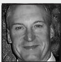
Chief Financial Officer, URS/ Engineered Products Division Carlsbad