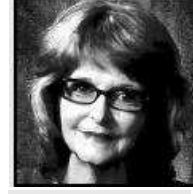
Superintendent, Carlsbad Municipal Schools Carlsbad