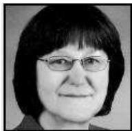
President, Chambers Benefit Group, APC Albuquerque