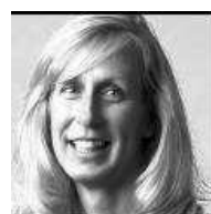
Features & Special Sections Editor, Albuquerque Journal Albuquerque