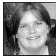
Chief Operating Officer, James Hamilton Construction Co. Silver City