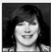
Director/HRTM, New Mexico State University Las Cruces